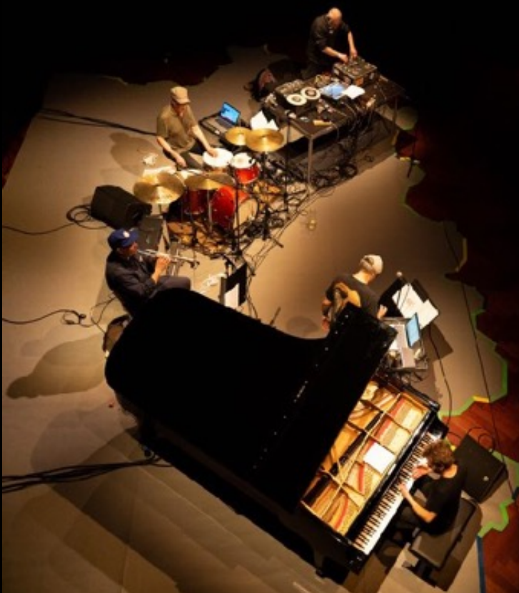
Festival Archipel, avril 2023