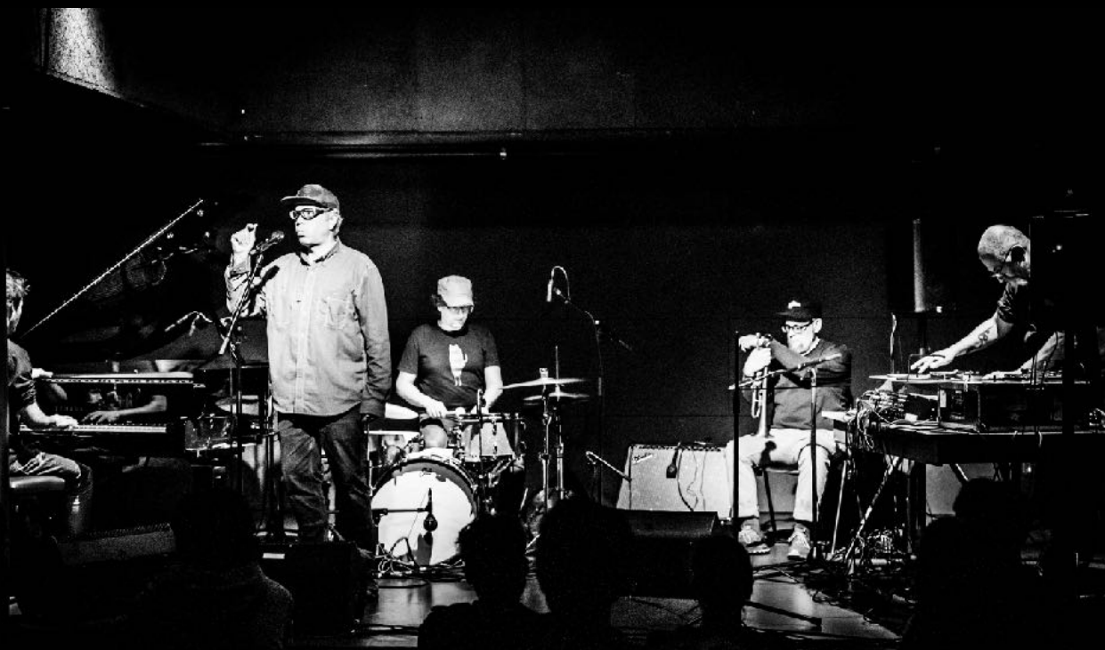
Cave12, Geneva (CH), 01.2024