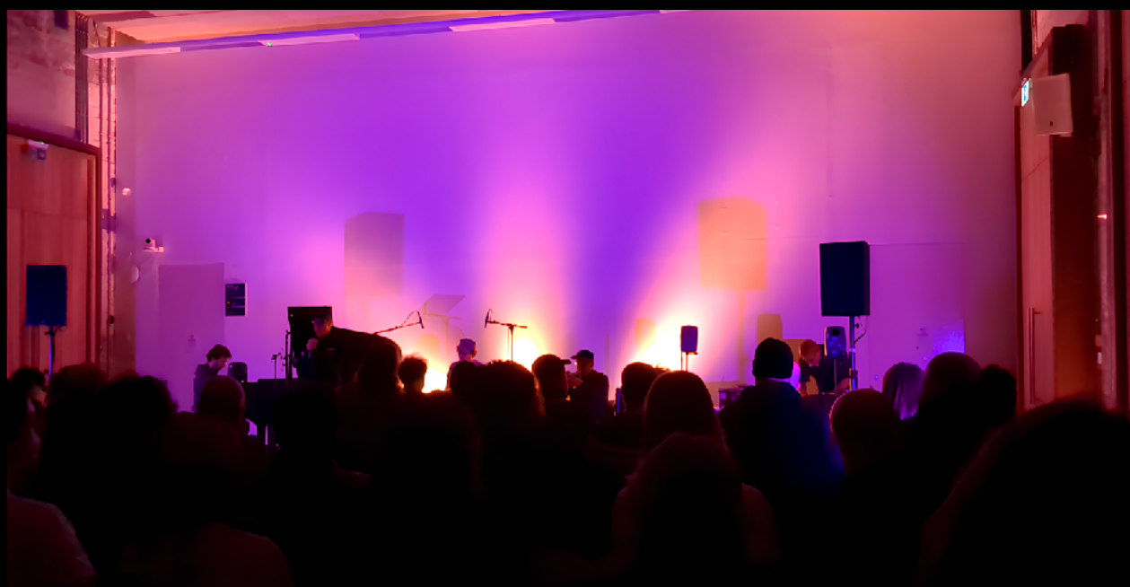
Reid School Of Music, Edinburgh (UK), 01.2024