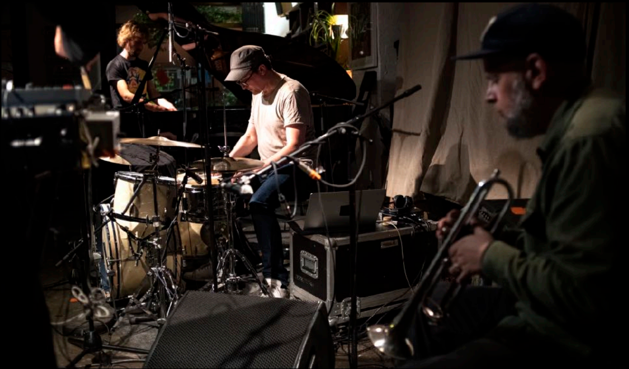
Cafe Oto, 09.2021